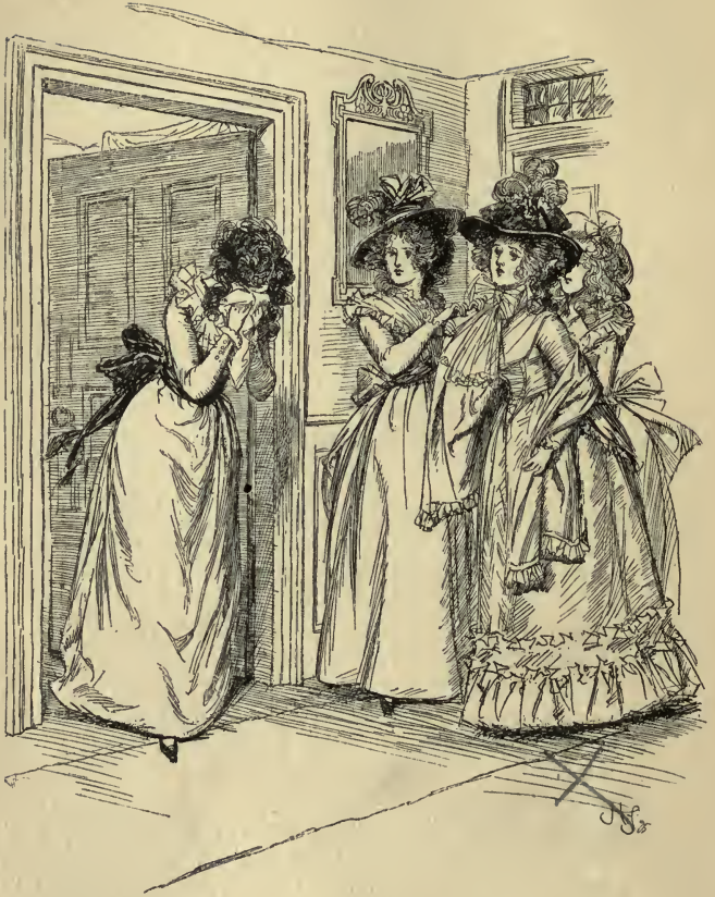
Apparently in violent affliction.